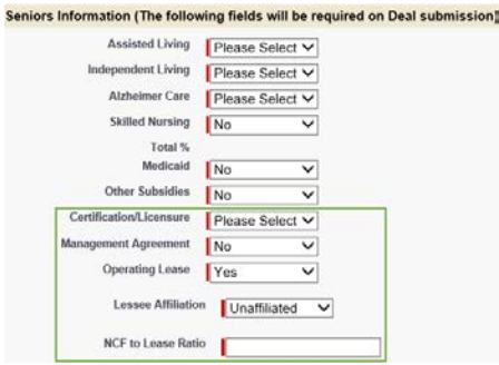
-- New fields under Seniors Information section--