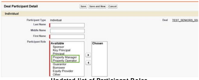
-- Updated list of Participant Roles--