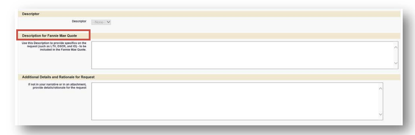
-Description for Fannie Mae Quote now allows 3000 characters-