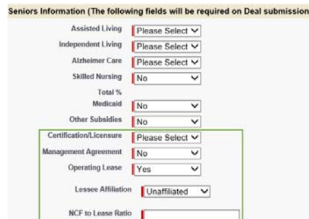
--New fields under Seniors Information section--