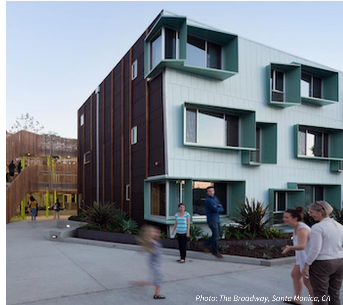
Photo: The Broadway, Santa Monica, CA